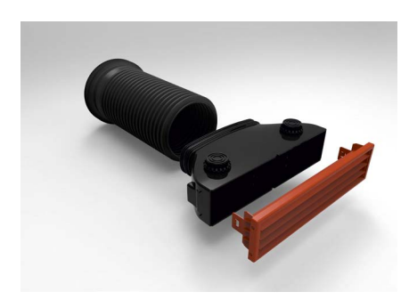
for wall thicknesses of 220-400 mm and 300-650 mm

Our wall ducting is available in two versions: brick-sized or surface-mounted. Depending on the outside wall one of these versions is used. For both versions two sizes of bellows are available (a short and a medium/long version). The corresponding grilles are available in various RAL colours. Other RAL colours may be available upon request.