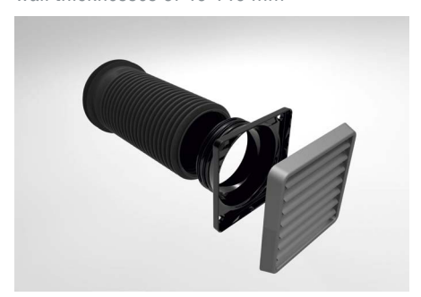
Medium/long wall ducting for surface-mounted grill for wall thicknesses of 120-350 mm and 250-600 mm