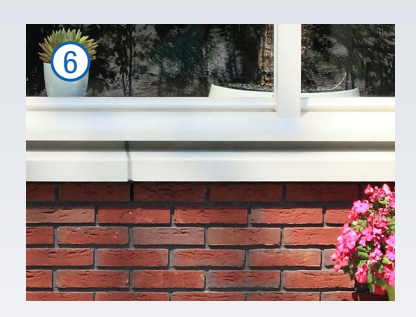
1. \ Brick-sized \ RAL \ 8015 \ \ / \ \ 2. \ \ Surface-mounted \ galvanized \ steel \ \ / \ \ 3. \ Roof \ tile \ ducting

4. Vertical / 5. Integrated in transom / 6. Through threshold