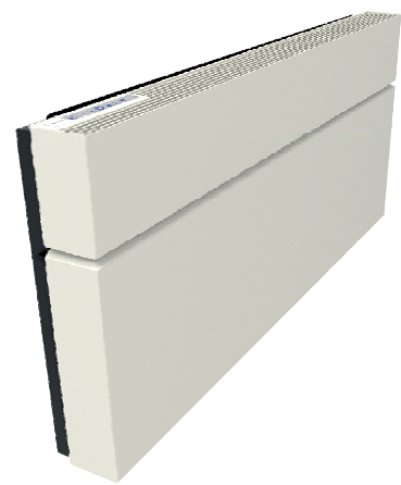
ClimaRad Care H1C