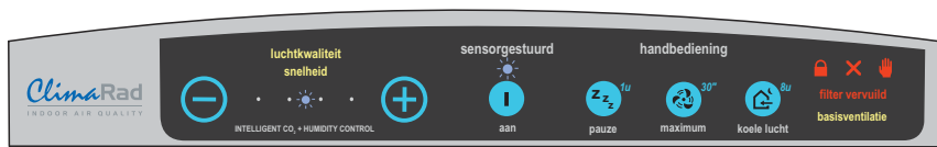
Control Panel Type I

You can operate your ventilation unit with the control panel on the upper side of the cover.