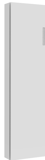
ClimaRad Ventura V1X